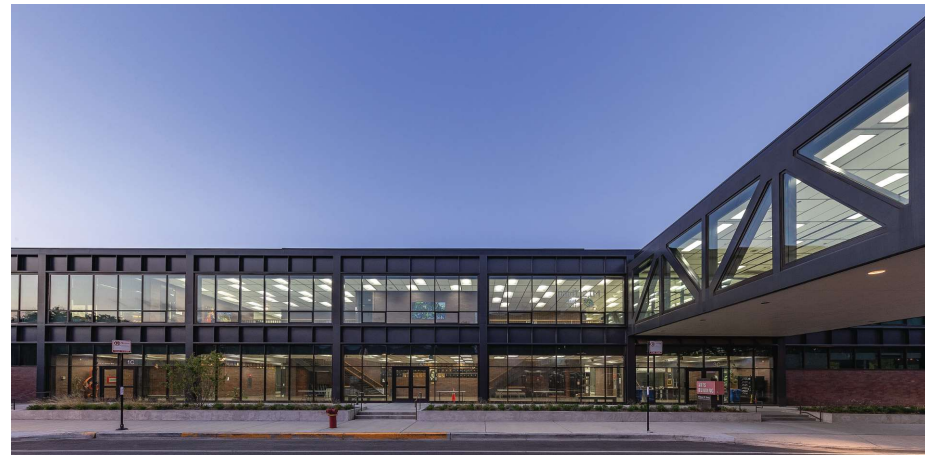
Top L&R: Building A Bridge Connector Bottom L: Building A-B Bridge Bottom R: Bldg C with Bridge