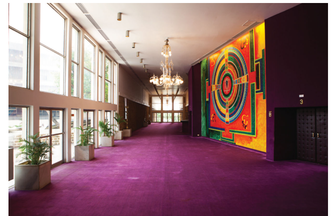
Top: View of entry passage and courtyard Bottom: View of entry