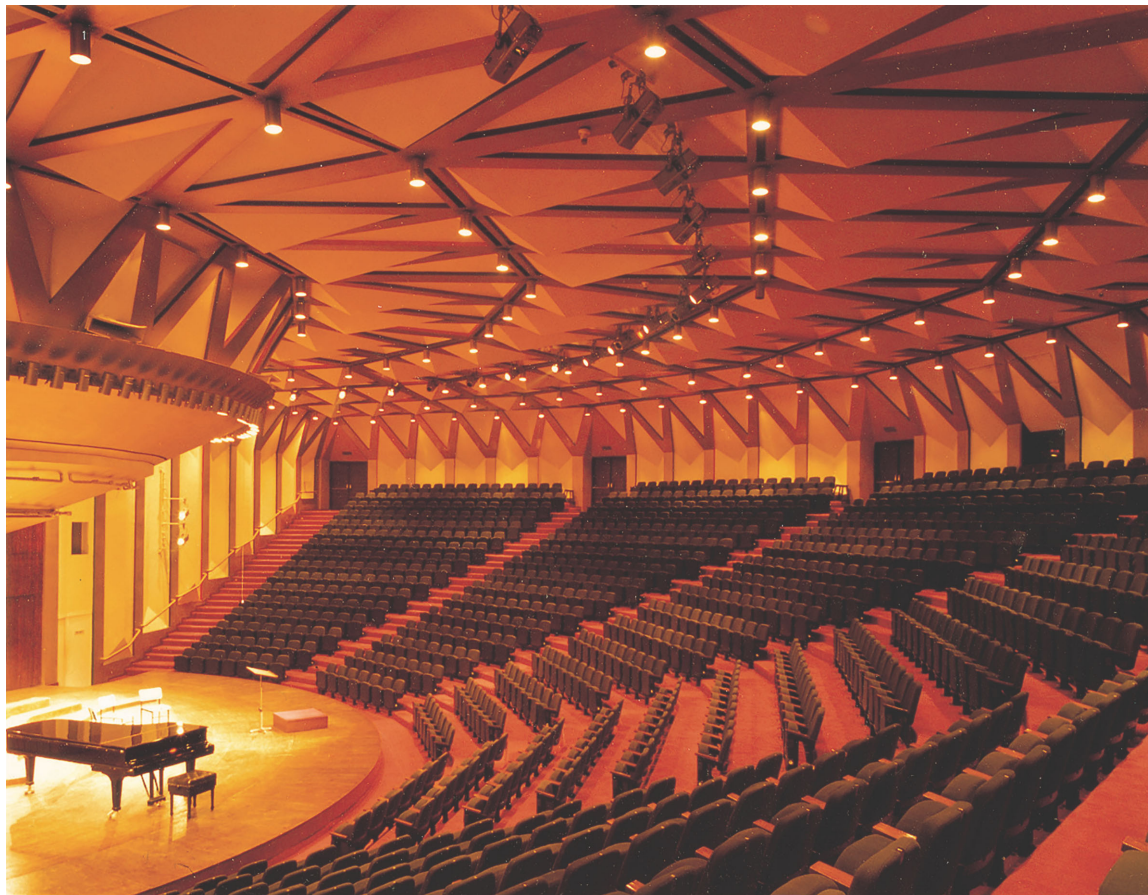
Top: View of interior