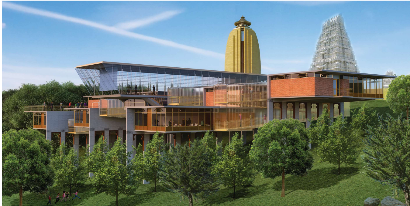
Top: View from NE Hills

CSA Partners Ltd. Architects & Urban Designers