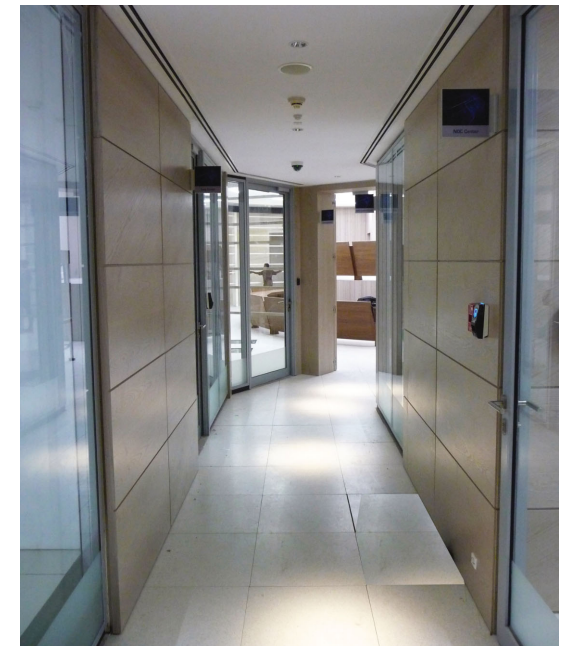
Top: View of in progress SOC room Top+ Bot. R: View of lobby and corridor to SOC room

Team Cyrus Subawalla-Principal Sangwan Seo-Associate Faquih & Associates-Architect of Record