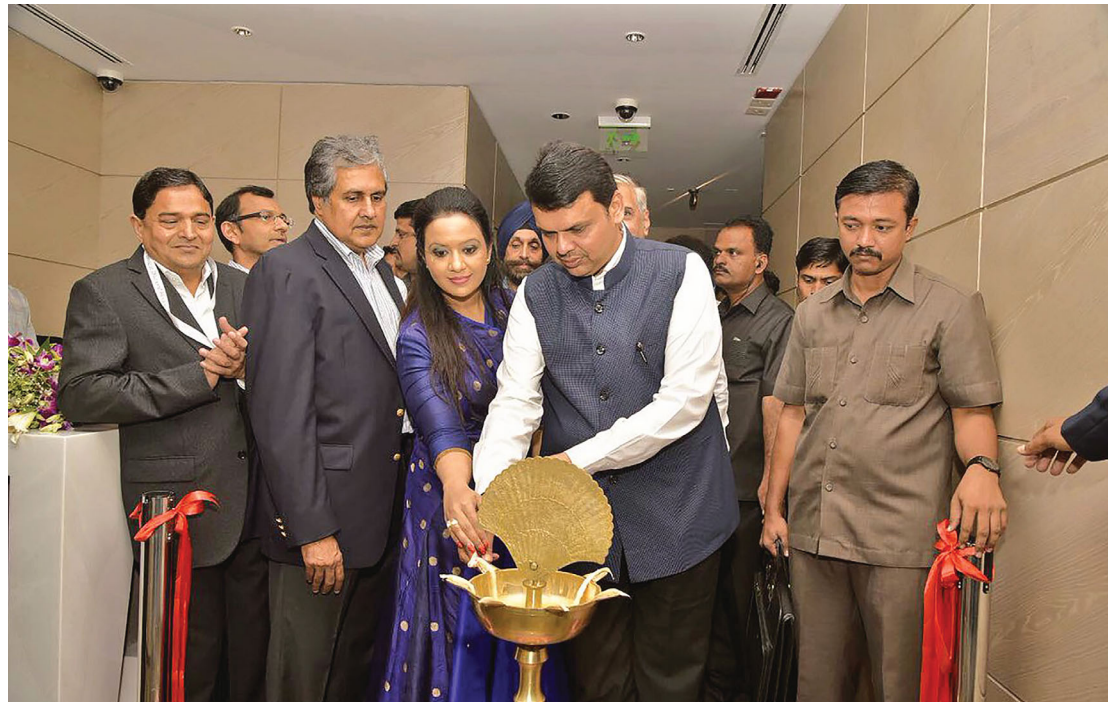
Top: Proposed SOC room Opening Ceremony Bottom: Perspective Concept

CSA Partners Ltd. Architects & Urban Designers