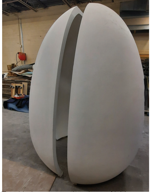
Top: Under construction views of lobby areas Middle: View and render of a classroom

Bottom: View of scallops in various locations and their