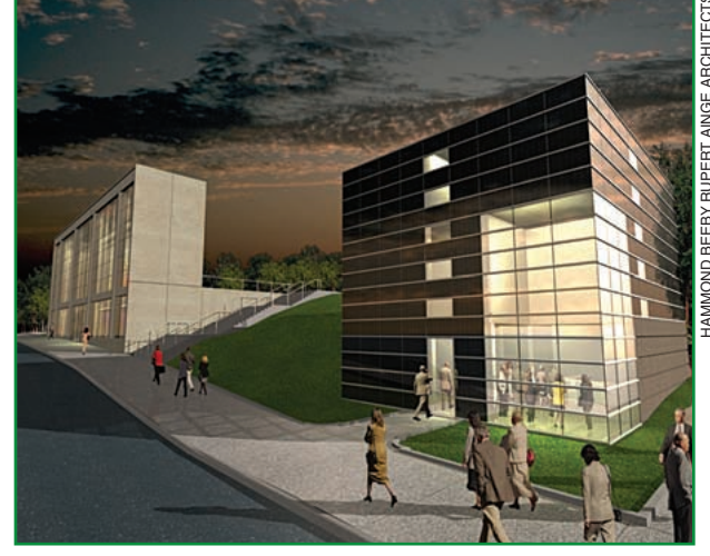
figure 6. Graphic rendering of the West Pavilion.