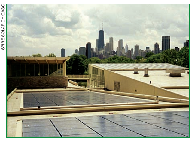
figure 2. Peggy Notebaert Nature Museum 33-kW solar PV system.

of the green power supplied under the agreement with ERT can be derived from landfill gas to energy.