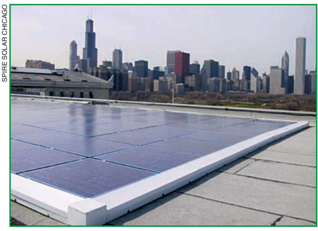
figure 1. Field Museum of Natural History, 100-kW Solar PV system.