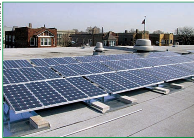
figure 3. E. Franklin Frazier Elementary School 10-kW solar PV system.

A key Partnership goal is to make Chicago Public Schools the nation's largest school-based solar energy network and a leader in environmental education. With this in mind, the "solar schools" have developed an innovative curriculum that