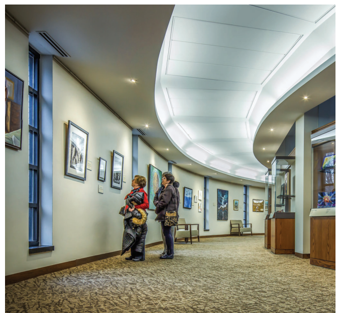
Top: Views of Memorial Alcove Bottom L&R: View of casework south gallery