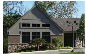
Kildeer - Village Hall