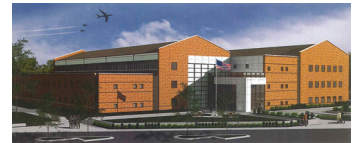
Scott Airforce Base-JIOC Addn.