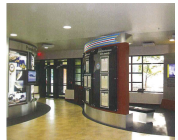
Scott Airforce Base-Bldg 1900