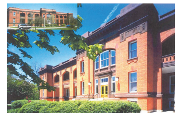
Great Lakes Naval Base-Bldg.26+27