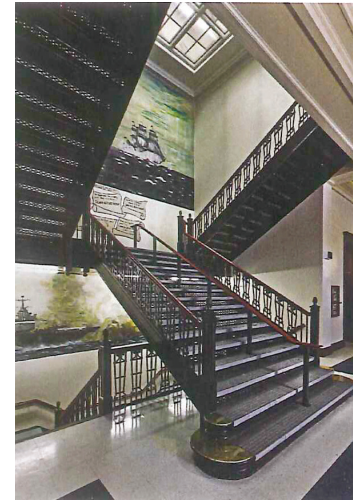
Great Lakes Naval Base-Bldg.3