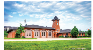
Algonquin Hills- New HQ Station