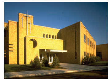
Marian Chapel East Entrance