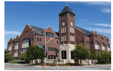
Arlington Heights - Village Hall

U.S. Green Building Council American Institute of Architects