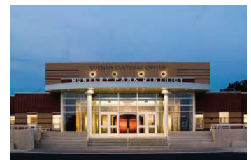
Huntley Park District REC