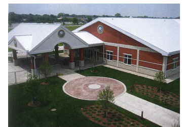
NAVFAC Camp Porter-Visitor Center