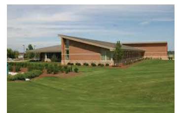
Lake in Hills-Village Hall