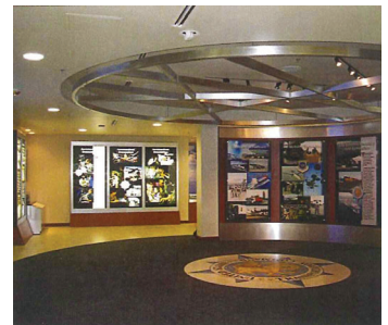
Scott Airforce Base-Bldg 1900