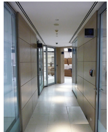
Bharat Diamond Bourse-Mumbai