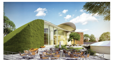
Godrej Mgmt Institute-Mumbai Architects & Urban Designers