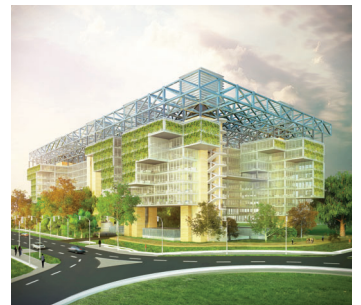
National Tax HQ-New Delhi