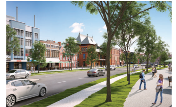
Next 50 Project-Lancaster CA

Hindu Temple Greater Chicago - Lemont, IL: Principal designer for a 13,500 sf education center for the learning of Hindu philosophy and culture. Concept Nov. 2018. Currently in fund-raising