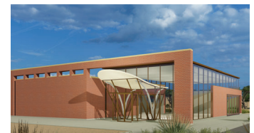
HTAV Social Hall-Lancaster CA

North Suburban Synagogue Beth El-Highland Park IL : Principal Designer for the comprehensive re-modeling of an 8,500 sf social hall and support facilities. In addition, addressing master plan needs for both building and site. Completed August 2013. Rotunda Completed. 2016, Chapel Completed. 2017. Sanctuary Completed. 2018. Zell Hall Addition 2019