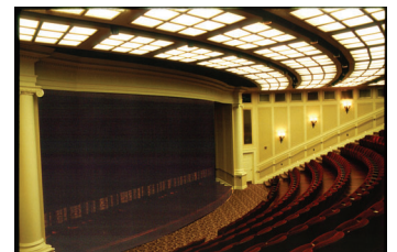
Mc Gowan Theater-Wash. DC.