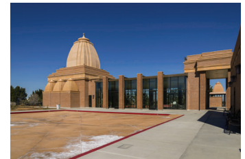
HTAV Main Temple-Lancaster CA

Hindu Temple, Antelope Valley - Lancaster California : Principal Designer for a 30,000 sf Hindu Temple complex in Antelope Valley California. Marrying traditional Indian temple design with the modern elements. Phase 1- Completed May 2015. Navgraha 2016 and Social hall in design 2019.