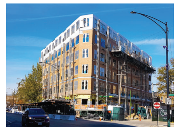
John Pennycuff Apts-Chicago