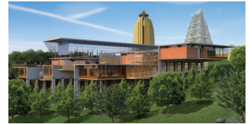
HTGC Education Ctr.- Lemont, IL