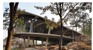
Shri Sai Dashama Ghar-Mumbai

Defense Research & Development Corporation-Hyderabad India : Design for sixteen residential buildings ranging in size from 650 sf to 2200 sf accommodating Scientist of varying seniority. Est. Completion Dec. 2020