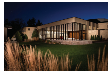
NSSBE-Blumberg Hall-Highland Pk

Shri Sai Dashama Ghar - Badlapur, Mumbai : Principal designer for a 10,000 sf state of the art minimal temple to Sai Baba. 73 foot free span portal frame structure with elliptical barrel vault. Phase I-shell Nov. 2018. Phase I balance work ongoing; Phase II currently in design.