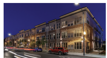
Aurea E Martinez Apts-Chicago Architects & Urban Designers