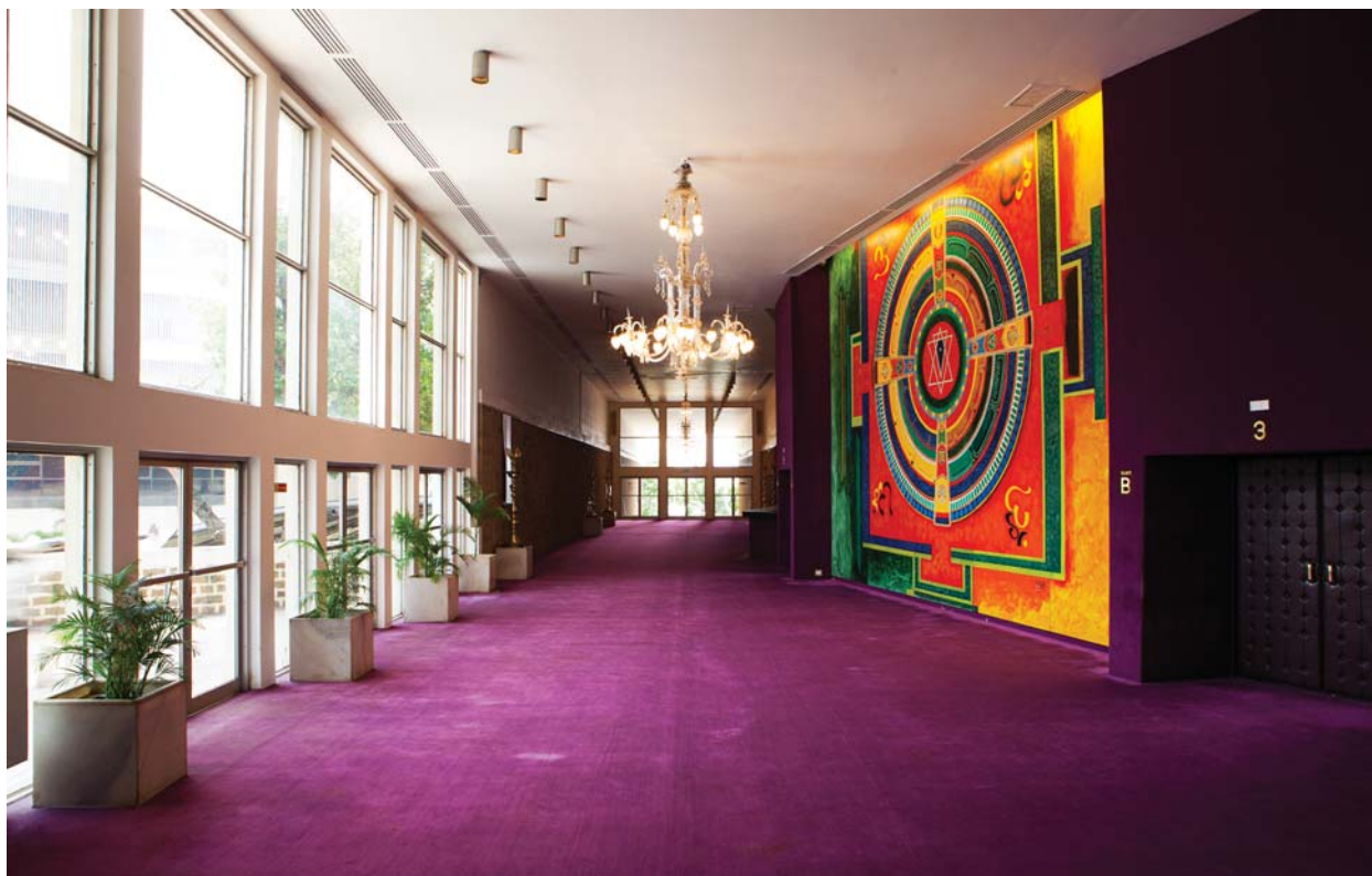
Top: View of entry passage and courtyard Bottom: View of entry